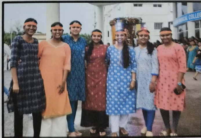
GANESH FESTIVAL CELEBRATION