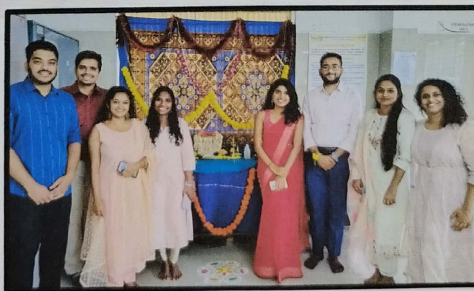
AYUD POOJA CELEBRATION DURING DASARA FESTIVAL